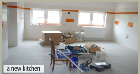
a new kitchen